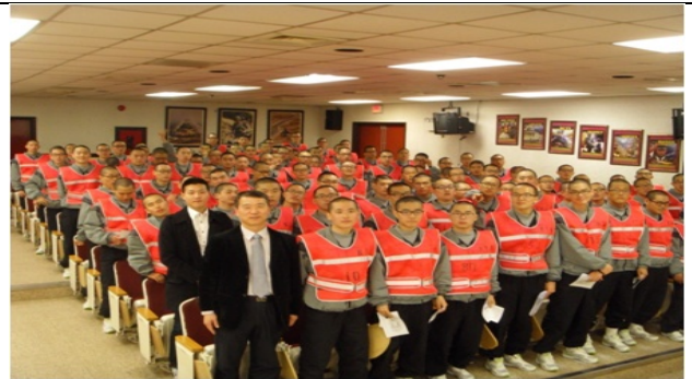
Group picture after worship service