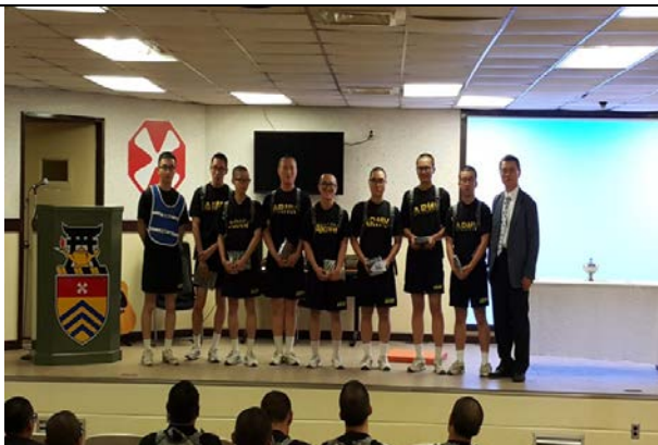
8 members was baptized