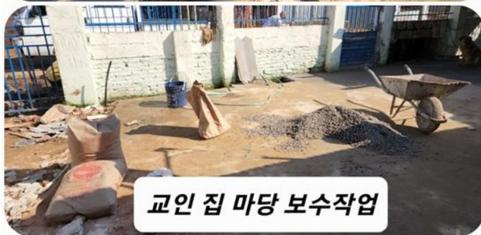
교인 집 마당 보수작업