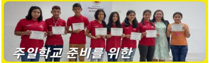
주일학교 준비를 위한