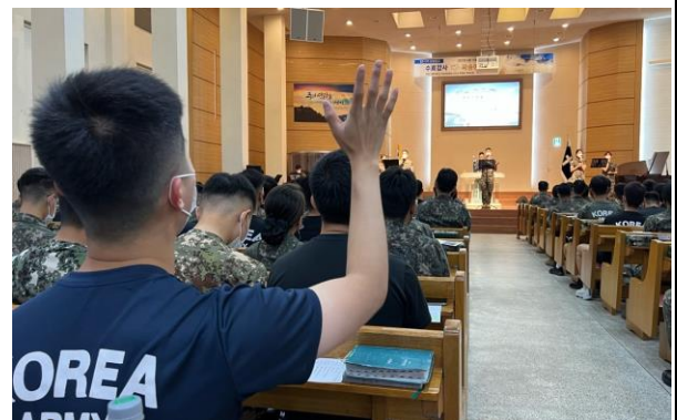
Visit to encourage for the Combat soldiers in 8Corp HQ