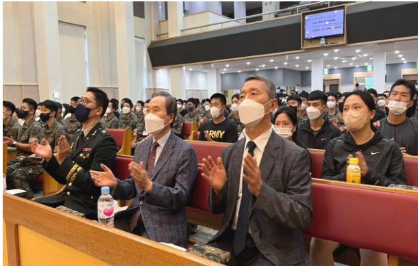
Worship service for 400 platoon leaders