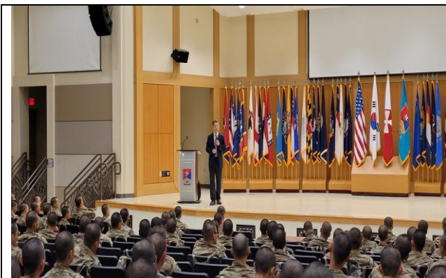
Last KATUSA worship service for Me

● Below pictures are shown on Last worship service. As of 16 October 2022,