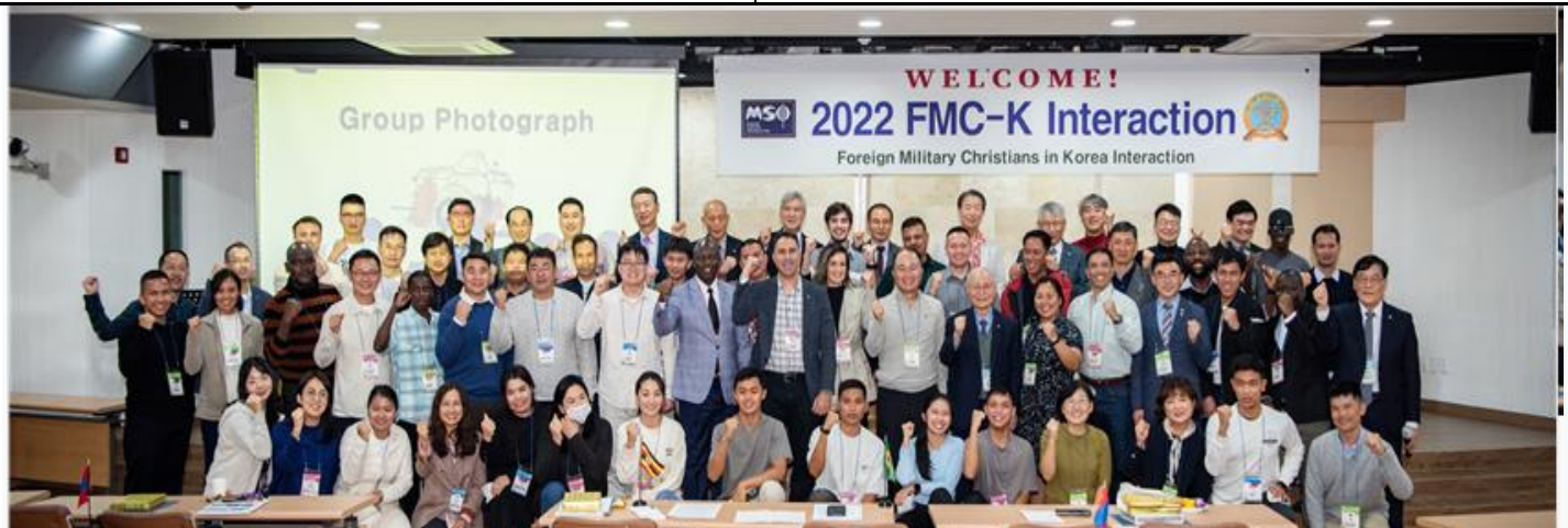
Foreign Military Christians in Korea (FMC-K) Interaction / 76 member out of 16 countries. Group picture after 5 days trained

Praise the Lord for overcoming the corona situation!