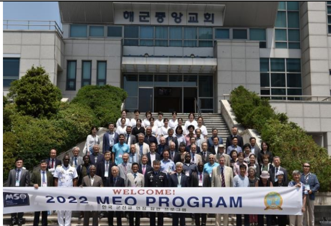
Military Evangelism Observation (MEO) Program/16 members from 12 countries. Group picture after 7days trained

(2022 Mission completion, 2023 Mission plan)