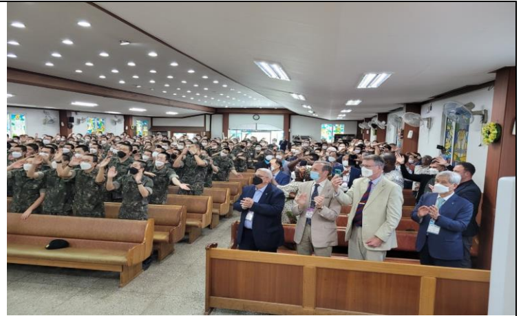
MEO Members participated to the Worship Service of the 25 th Infantry Division Chapel