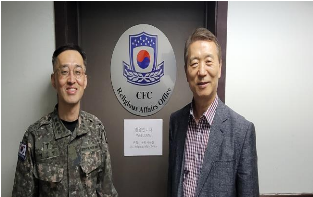
Deputy CFC Command chaplain /ROK Senior Chaplain 1 Nov 2021.