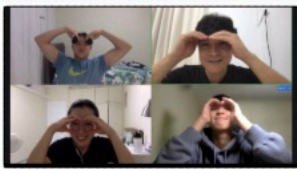
Weekly Family Zoom Meeting