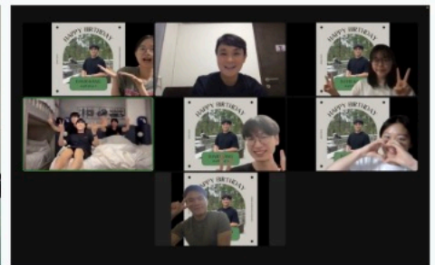
MK Ministry in Bogor & IY Youth Training