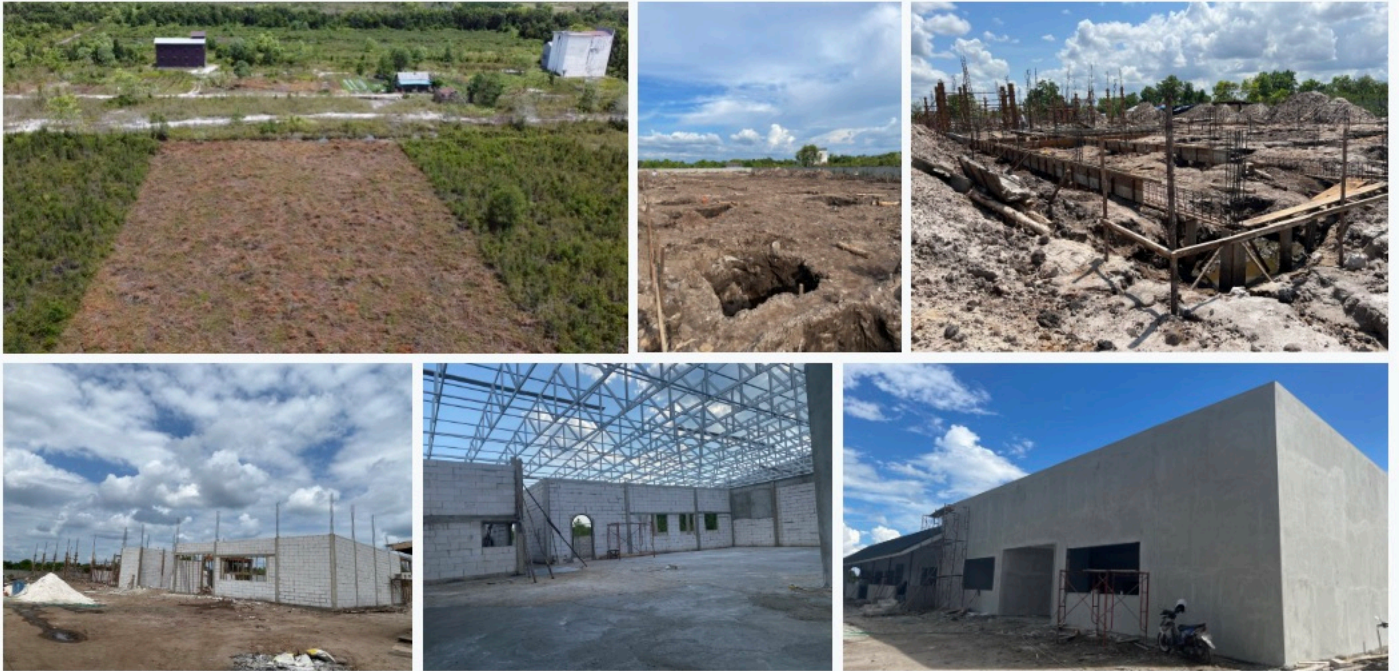
Progress of IGI Mission Center Construction

God has helped us to build IGI mission center in Palangkaraya, Indonesia for the work He will do in Central Kalimantan. We praise God for guiding us through the long process, from purchasing the land to completing the paperwork and the actual construction, without any accidents or setbacks. Although the construction has not yet fully finished, we were able to hold the dedication service for the mission center on the 11th December, as originally planned.