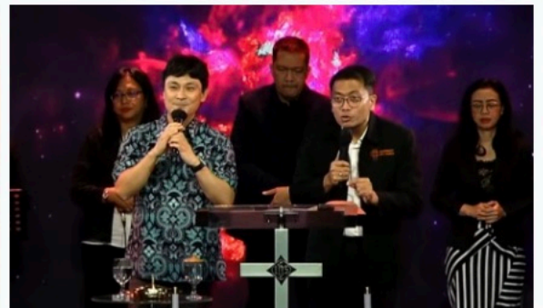
Blessing Community Church & Charismatic City Church in Jakarta