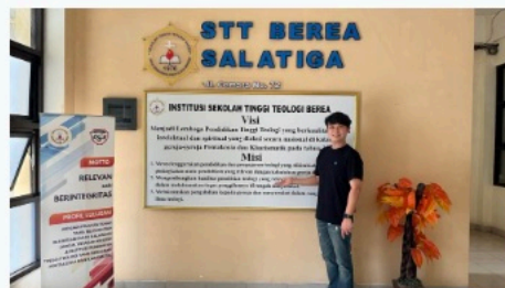
Berea Bible School in Salatiga

If God allows, we would also like to teach the Bible to local ministers in more places. Through this work, we hope to build fellowship and cooperation with other ministers who are interested in reaching out unreached people groups in Central Kalimantan so that opportunities may quickly open to take the Gospel to places where it has not yet reached. Please pray that these doors may be opened soon.