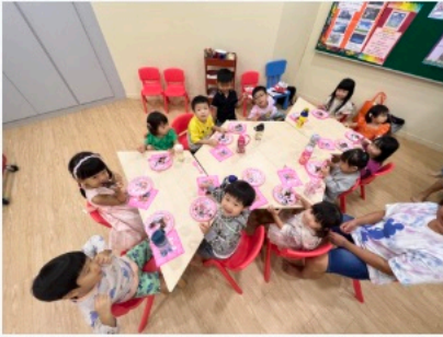
NHK SUNDAY SCHOOL